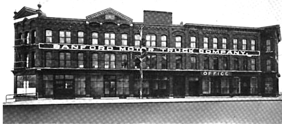
Plant of the Sanford Motor Truck Co., Syracuse, New York.

SITTING AGAINST A SECTION OF THE ERIE CANAL AT WEST FAYETTE STREET, ERIE AND HIAWATHA BOULEVARDS